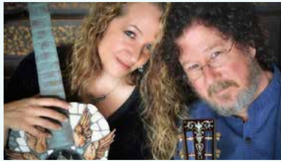
A Celtic Christmas, Nov. 30

30 Annual Thanksgiving Kiln Opening, Traditions Pottery Studio, Blow-