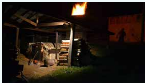
Traditions Pottery Kiln Opening, Nov. 30

29 Christmas in the Park & Lighting of the Town, Memorial Park, downtown Blowing Rock. 2-9pm. Santa, hot chocolate and the ceremonial Lighting of the Town. 828-295-5222. www.blowingrock.com