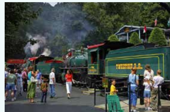
Railroad Heritage Weekend at Tweetsie Railroad, Sept. 7-9

7 10th Annual Grandfather Mountain KidFest , Grandfather Mountain. All-day event is included with park admission: guided hikes, games, storytellers, music and more. Tickets: $18 adults 13-59, $13 seniors 60+, $8 children 4-12, Free for children 3 and younger. www.grandfather.com