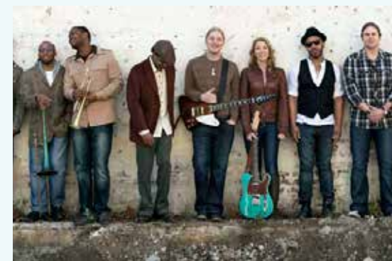
Tedeschi Trucks Band, Nov. 1

Thurs: 10am-7pm, Fri-Sat: 10am-5pm. Closed Sunday and Monday. Admission: $8 adults, $5 children 5+ / students / military, $6 groups (10+). 828-295-9099. www.blowingrockmuseum.org