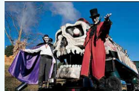
Ghost Train at Tweetsie Railroad, Sept. 27-Nov. 3