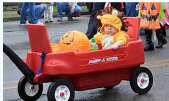
Blowing Rock Halloween Festival, Oct. 26