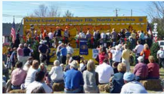
Woolly Worm Festival, Oct. 19 & 20