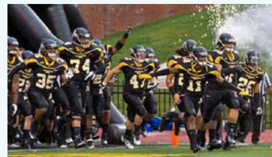
ASU vs. Samford, Oct. 12