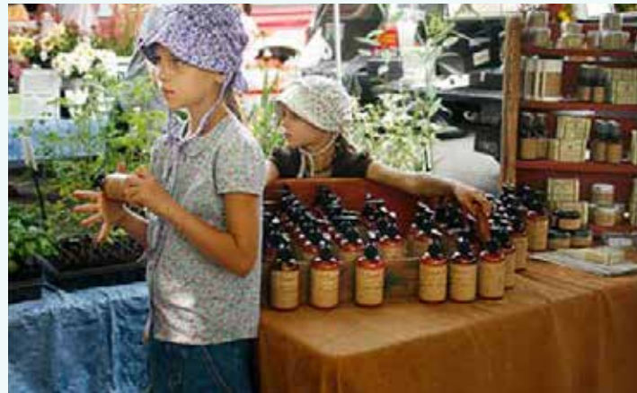
Left: "Strings N' Things: Old-Time Mountain Music" at BRAHM;