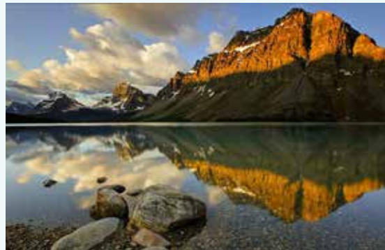
Banff Film Festival, Sept. 20 & 21

20-21 Banff Film Festival , Appalachian State University, Schaefer Center for the Performing Arts. Features the world's best films on mountain adventure, culture, and the environment selected from over 400 films submitted from over 40 different countries around the globe. 7:30pm. Tickets: $10 adults, $8 students. 828-262-4046. www.pas.appstate.edu