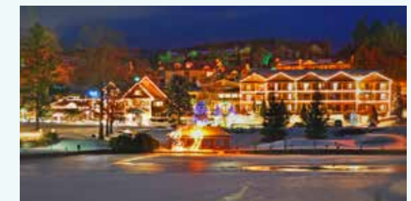
Chetola's Festival of Lights, Nov. 29-Jan. 26, 2014

29 Chetola's Festival of Lights , lights are turned on at dusk and remain lit through late January 2014. www.chetola.com