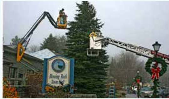
Lighting of the Town, Nov. 29

29-30 Horse & Carriage Rides, Santa, Cookie Decorating, and Buffet, 5:30-9:30pm, Chetola. www.chetola.com