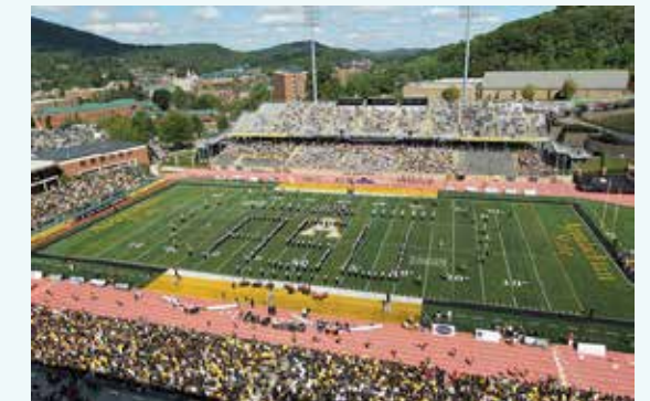
ASU vs. Charleston Southern, Sept. 28

28 & 29 Vincent , Blowing Rock School. Ensemble Stage. Weaving reminiscences with excerpts from than 500 letters artist