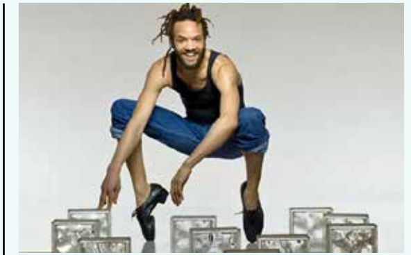
Savion Glover's STePz, Nov. 15

15 Savion Glover's STePz , Appalachian State University, Schaefer Center for the Performing Arts. Glover and his ensemble of dancers (TLHS) take tap dance to new