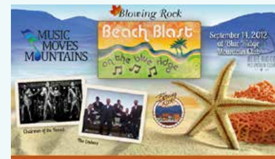
Beach Blast on the Blue Ridge, Sept. 14

14 Isabella Propeller and the Magic Beanie , Blowing Rock School. Ensemble Stage's Summer Kids Saturday Theatre Series. 828-414-1844. www.ensemblestage.com